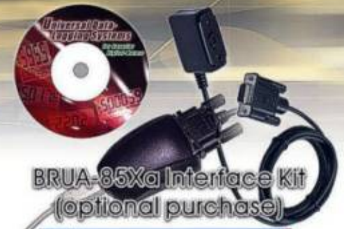
BRUA-85Xa Interface Kit (optional purchase)